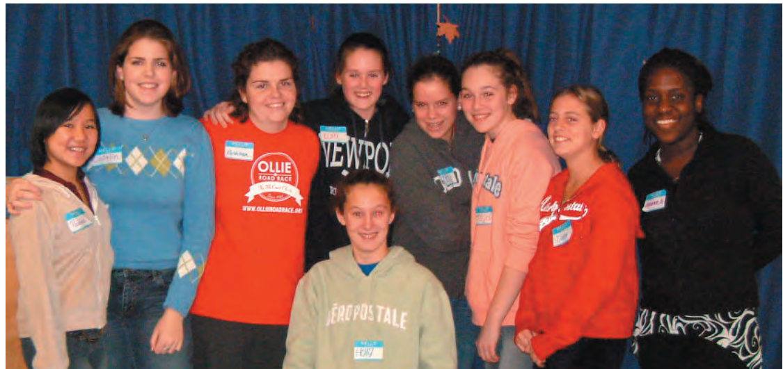
The CYWH Peer Leaders visit South Boston Neighborhood House for "Conversations" a free interactive educational program for teen girls.